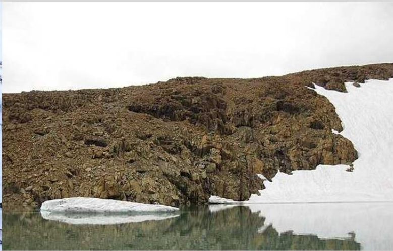
Glacier of the Romantics