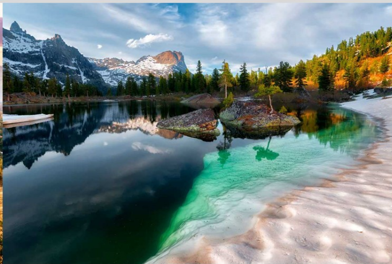
Natural Park «Ergaki»