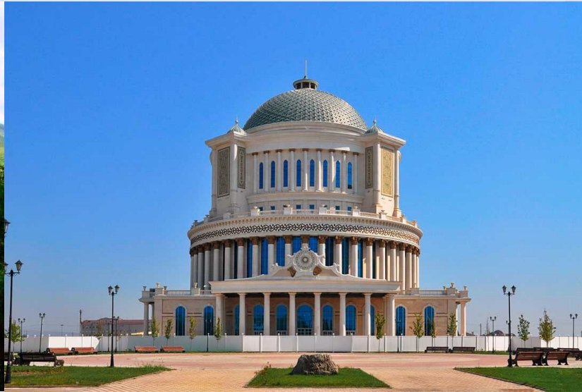
Palace of Receptions