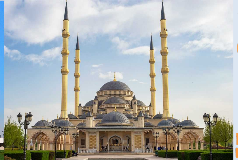
Mosque "Heart of Chechnya" named after Akhmat Kadyrov