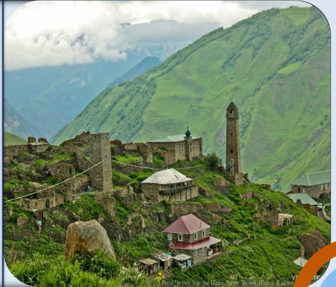
Горы Чечни. Ущелье Шаро-Аргун. Хисой, Шарой

The population of the republic is 1,267,740 people (January 1, 2010). The population density is 85 people/km 2 (2009), the share of the urban population is 35.3% (2010).