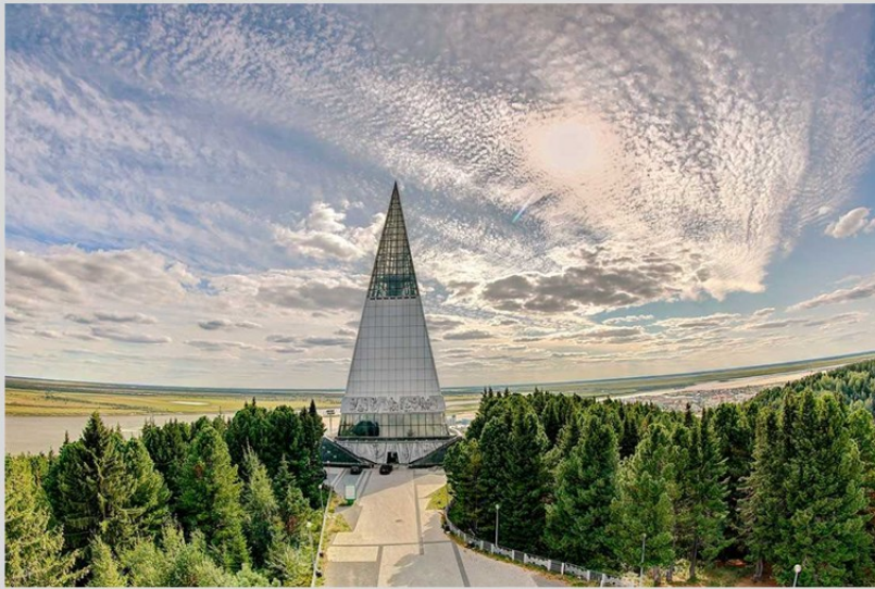
Monument to the discoverers of the Ugra land