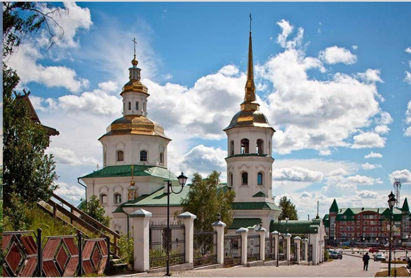
Church of the Intercession of the Blessed Virgin Mary