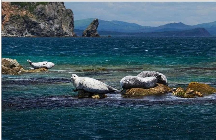
Far Eastern seareserve